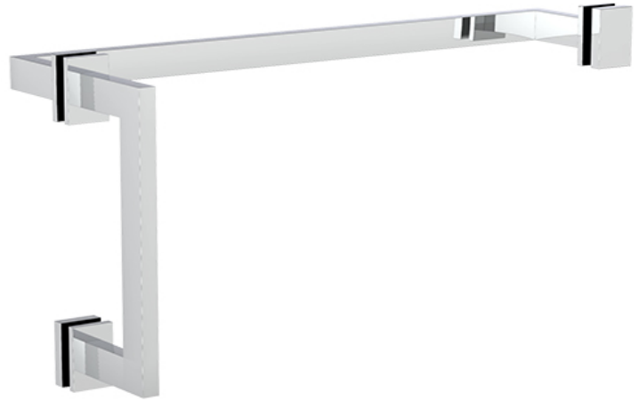
Offset Door Handle