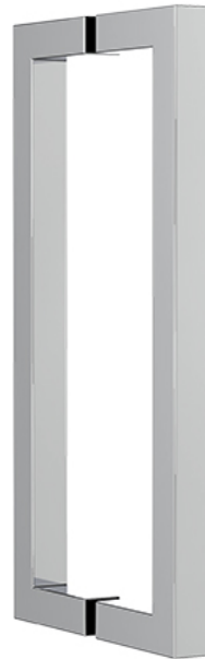
Double Door Handle shown with no Rosette