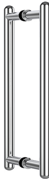
Double Door Handle shown with a small Rosette